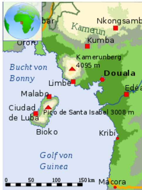
Location of Kribi in Cameroon (source: Wikipedia).